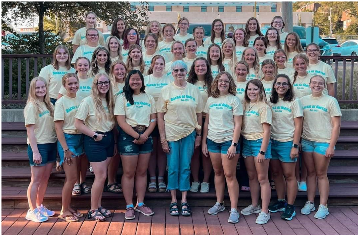
The 2022-2023 Clovers (and House Mother)